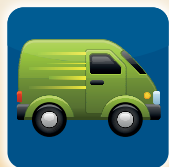
Parcel Courier Services