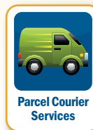
Parcel Courier Services

Use us to minimise your gas, electricity and water costs. Our utility procurement specialists keep a constant watch on the whole market and are independent of the energy providers.