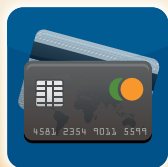
Credit Card Fees