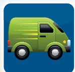
Parcel Courier Services