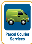
Parcel Courier Services

Use us to minimise your gas, electricity and water costs. Our utility procurement specialists keep a constant watch on the whole market and are independent of the energy providers.