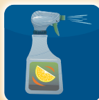
Cleaning and Hygiene Supplies