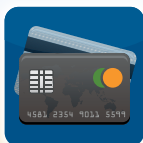
Credit Card Fees